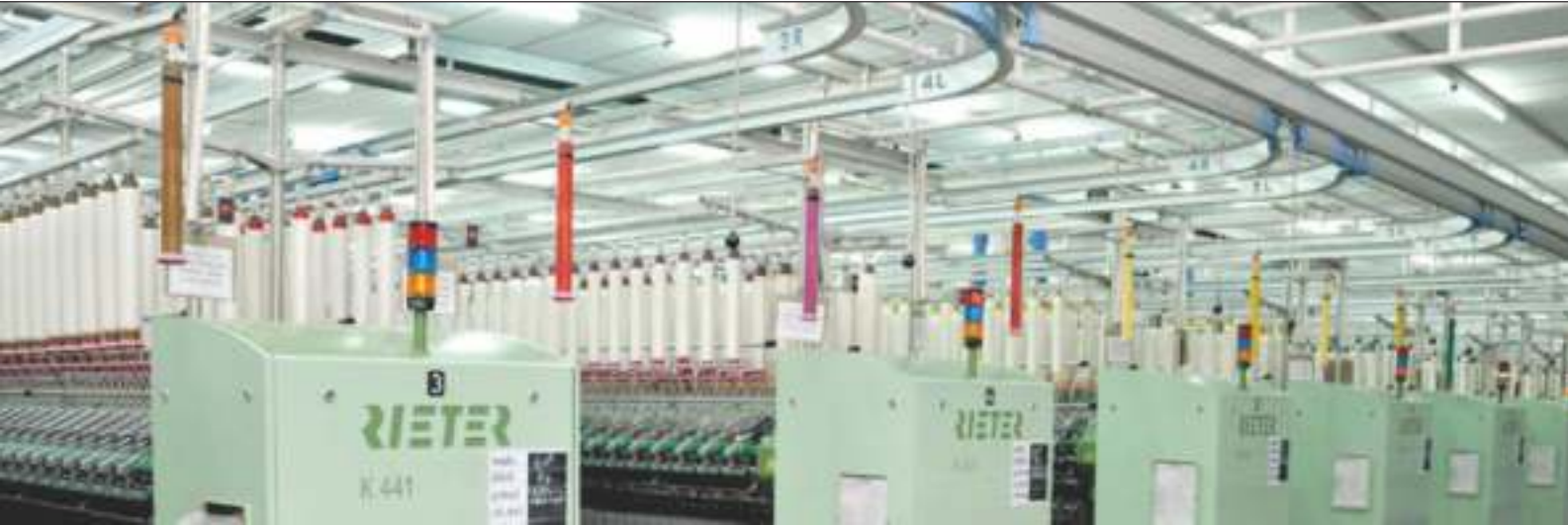
Autotex Bobbin Holder in Rieter Ring Spinning Machine