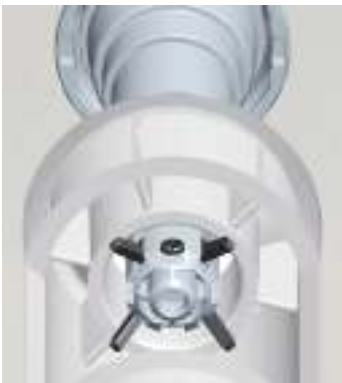
For a Stable Holding