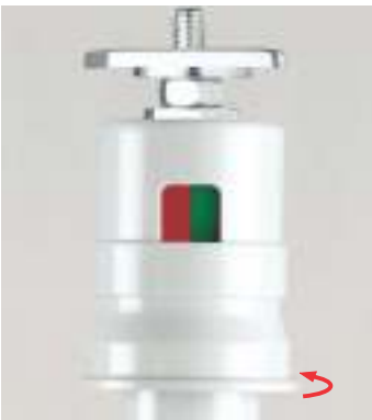
Turn for required stage