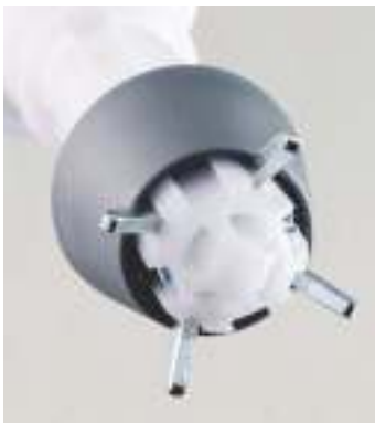
Four Point Holding