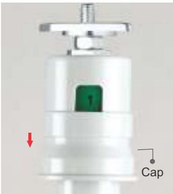
Pull down the Cap gently