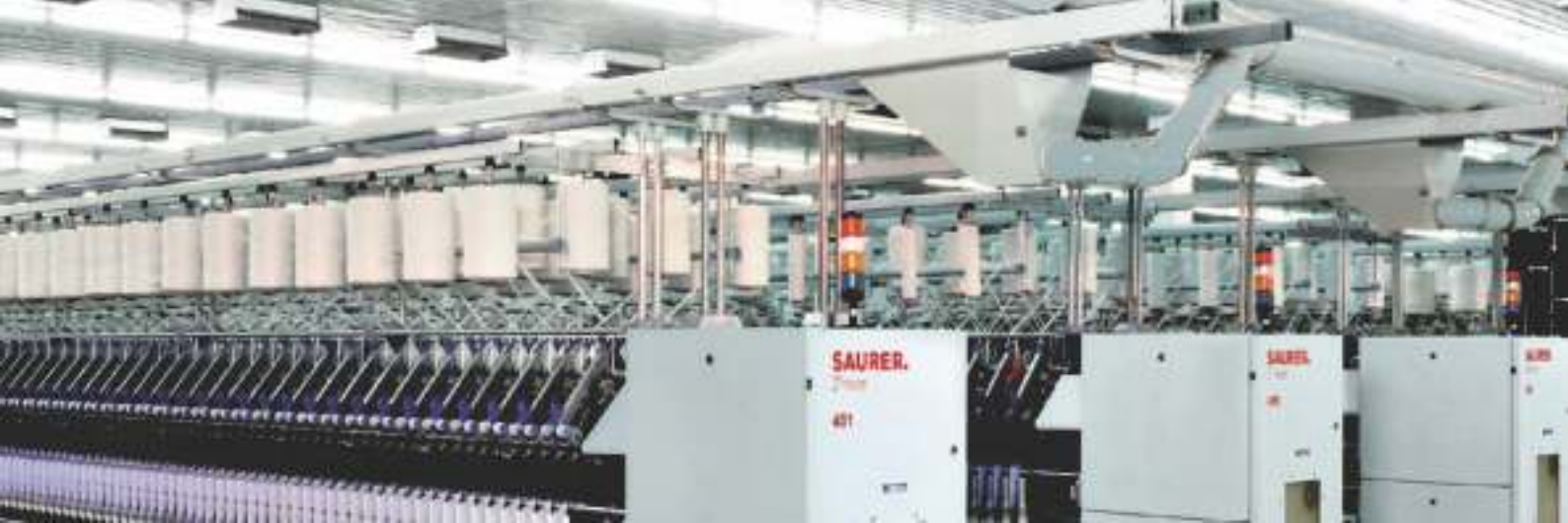
Autotex Bobbin Holder in Saurer Worsted Spinning Machine