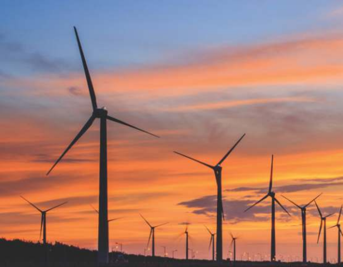
Autotex wind farm at Karnataka - India