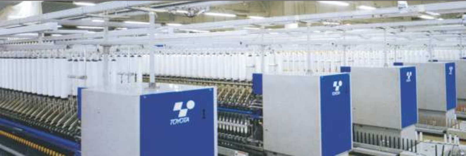
Autotex Bobbin Holder in Toyota Ring Spinning Machine

The ratchet mechanism is successfully tested for 1,00,000 strokes which is more than 20 years of life in normal working condition.