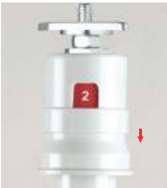
Release the Cap to locate