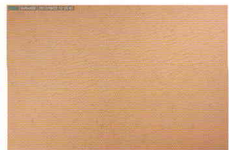
PRECITEX XP Apron