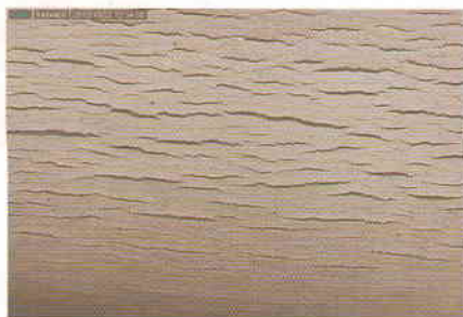
Regular Apron Type A

XP apron in comparison with other types after exposure to Ozone of very high concentration :-