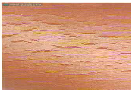
Regular Apron Type B